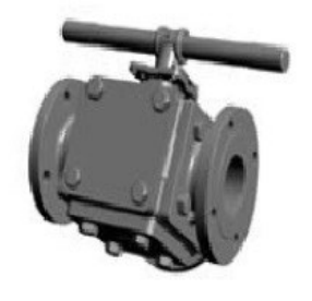
3" CLASS 150 (PN16)