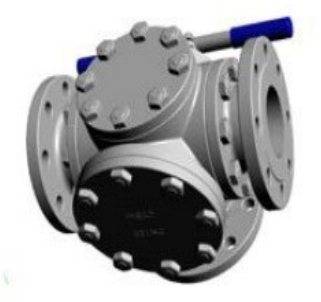
3" CLASS 300 (PN40)